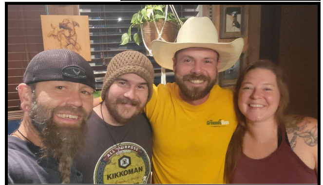
Awesome volunteers helping install new subfloor